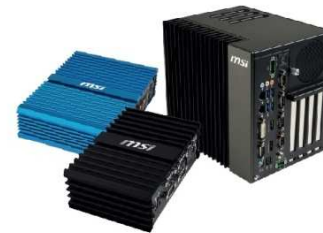
Fanless Box PC