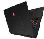
GAMING GE Series