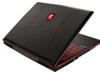
GL63 / GL73