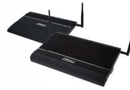
Slim Fanless Box PC