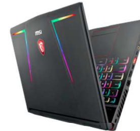
GE63 Raider RGB