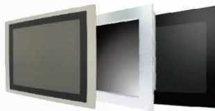
HMI Panel PC