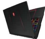
GAMING GE Series