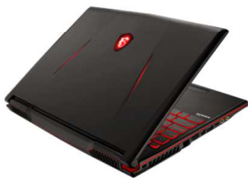
GL63 / GL73