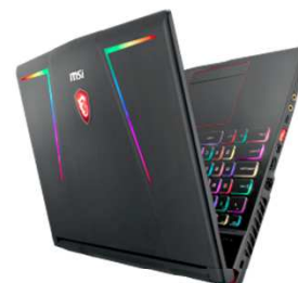
GE63 Raider RGB