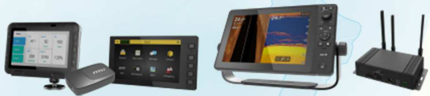
Vehicle Tablet Marine Display IoT Gateway