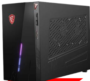
MEG INFINITE S