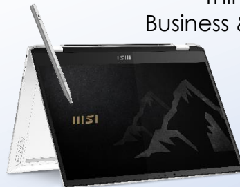
Pen & Accessories