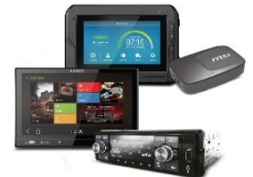
Automotive & Commercial Solutions