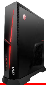
MEG TRIDENT A