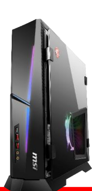
MEG TRIDENT X