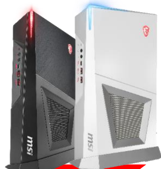
MEG TRIDENT 3