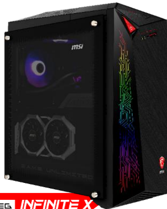
MEG INFINITE X