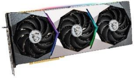
Suprim Graphics Card