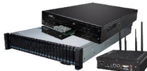
Server & Networking