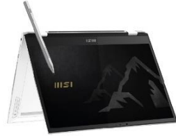
Business & Productivity Notebook