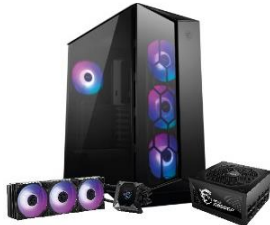
Case, Cooling & PSU