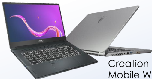
Creation & Mobile Workstation