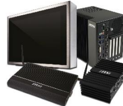
Industrial Platform Solutions