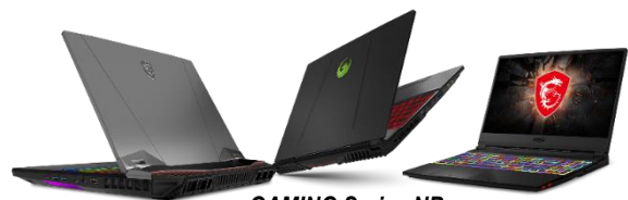
GAMING Series NB