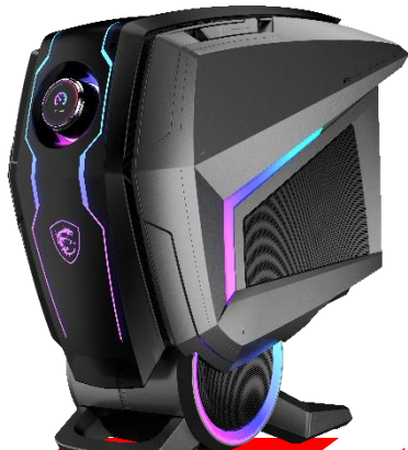
MEG REGIS T15