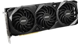
Ventus Graphics Card