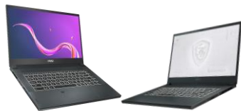
Content Creator NB