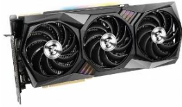
Gaming Trio Graphics Card