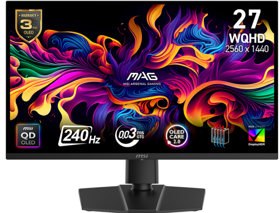
Picture and logos

Der MSI MAG 271QP QD-OLED X24 Gaming-Monitor, 27 Zoll atemberaubendes QD-OLED, 2560x1440 (WQHD) und 240Hz für ultra-flüssige Grafiken. Perfekt für wettbewerbsorientierte Spieler, die nach Immersion suchen.