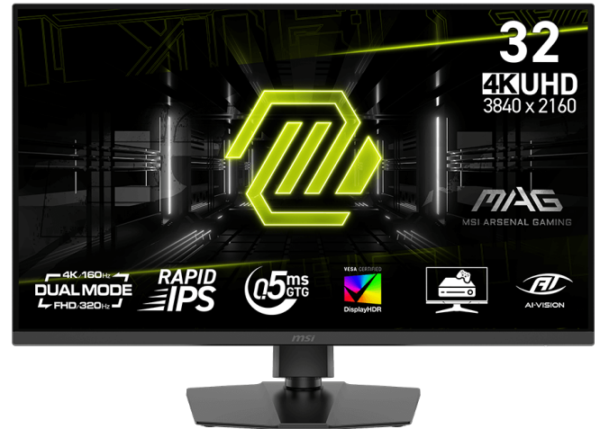
Picture and logos

Der MAG 322URDFDE E16 Gaming-Monitor mit 27 Zoll Rapid IPS, Dual-Modus für UHD 160 Hz und FHD 320 Hz sowie DisplayHDR 400 für extrem flüssige Bilder. Entfessel dein volles Potenzial.