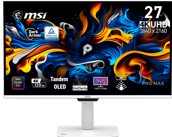
Picture and logos