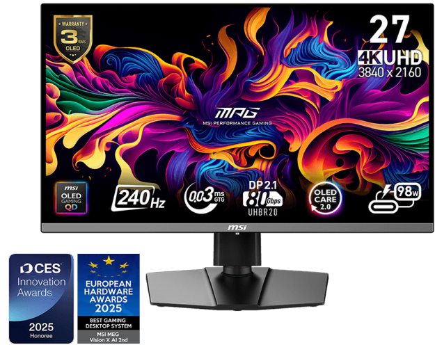
Picture and logos

The MSI MPG 272URX QD-OLED Gaming Monitor, 27 inches of stunning QD-OLED, 3840x2160 (4K UHD) and 240Hz for ultra-smooth visuals. Perfect for competitive gamers seeking immersion. Upgrade your setup—check out now and game on!