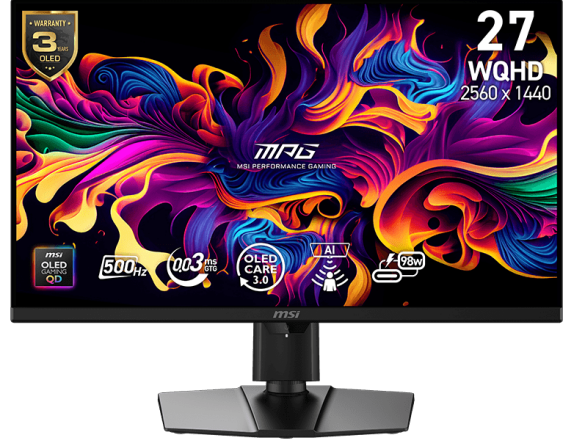
Picture and logos

The MSI MPG 271QR QD-OLED X50 Gaming Monitor, 27 inches of stunning QD-OLED, 2560x1440 (WQHD) and 500Hz for ultra-smooth visuals. Perfect for competitive gamers seeking immersion. Upgrade your setup—check out now and game on!